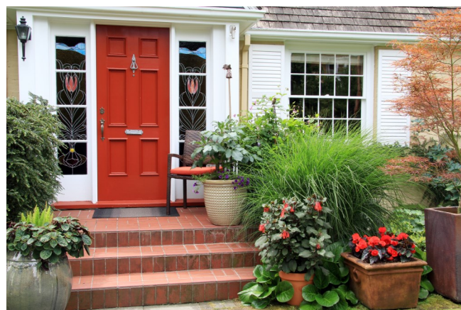
Clustered containers filled with interesting textural foliage and flowers hug this porch, providing a unique entrance.

We couldn't be more optimistic about our future, and our team looks forward to being of service to you too!